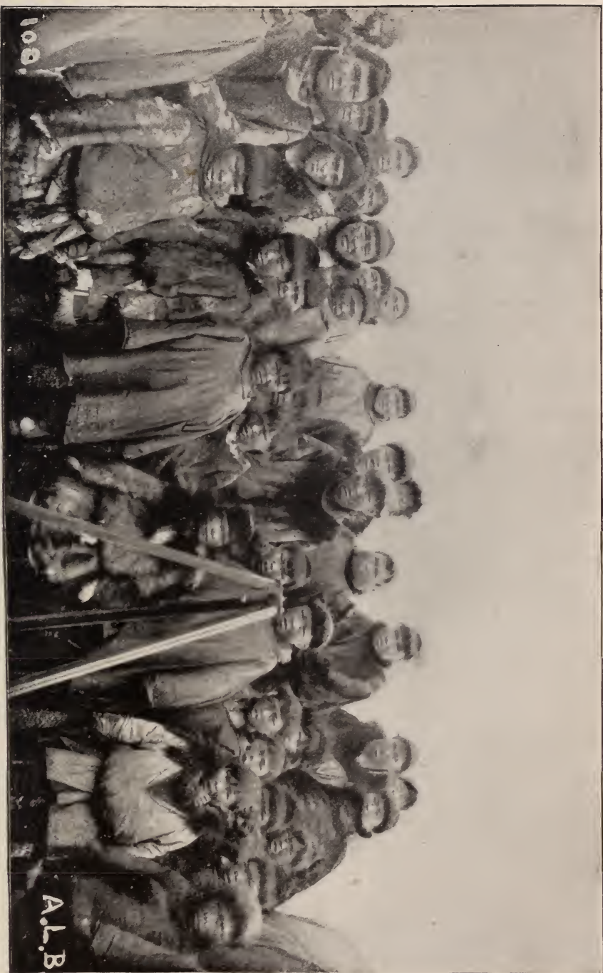
A GROUP OF ESKIMO AT ST. LAWRENCE ISLAND, ALASKA.